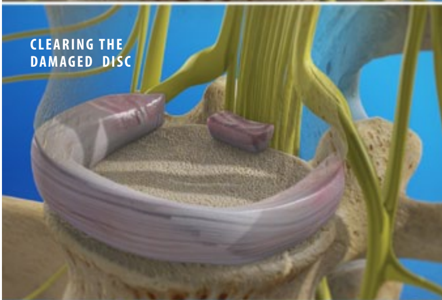
CLEARING THE DAMAGED DISC