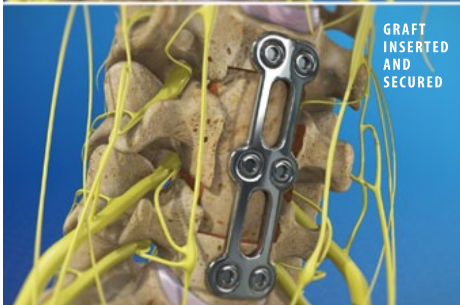
GRAFT INSERTED AND SECURED